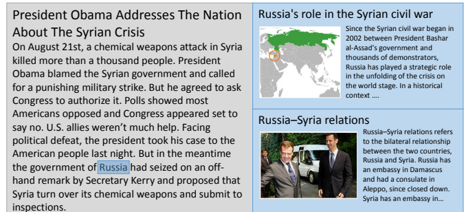
Figure 1: Contextual Insights experience.

knowledge base (Web pages, entities, etc.) that are relevant to the focus of attention and the context. In this paper, we present a system, called Leibniz, that provides a solution for the contextual insights problem, implementing a general architecture that leverages existing search engine technology; and an experimental evaluation of the Leibniz contextual insights system.